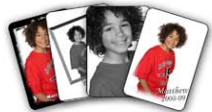
2x3 Die Cut Magnets