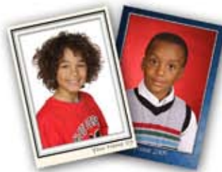
Bordered Wallets with Personalization