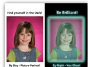
Glow in the Dark!