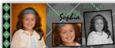
4x10 Desk Display