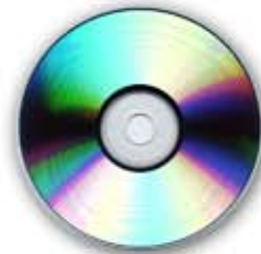
Hi-Def Image CD with copyright release