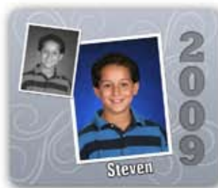
9.75x9.75 Custom Mouse Pad