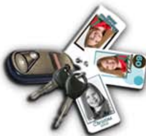
Set of 3 Key Tags