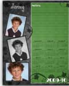
8x10 Dry Erase Message Center (Magnetic)