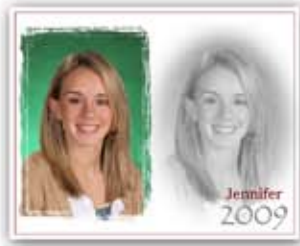
8x10 Reflection Portrait